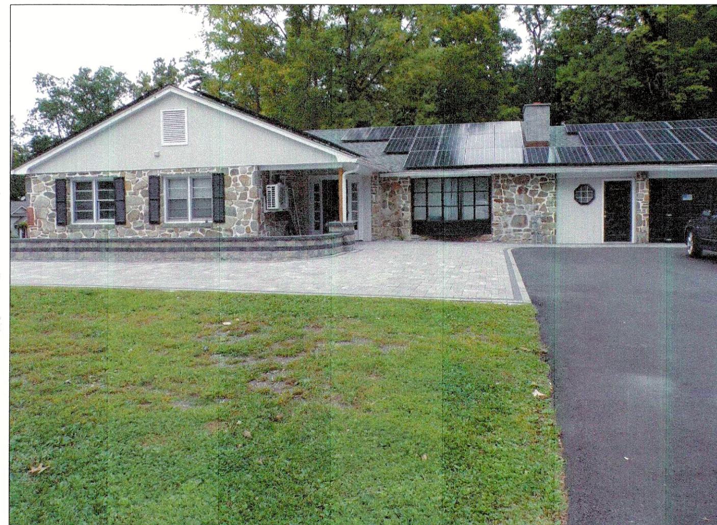
FRONT VIEW OF BUILDING