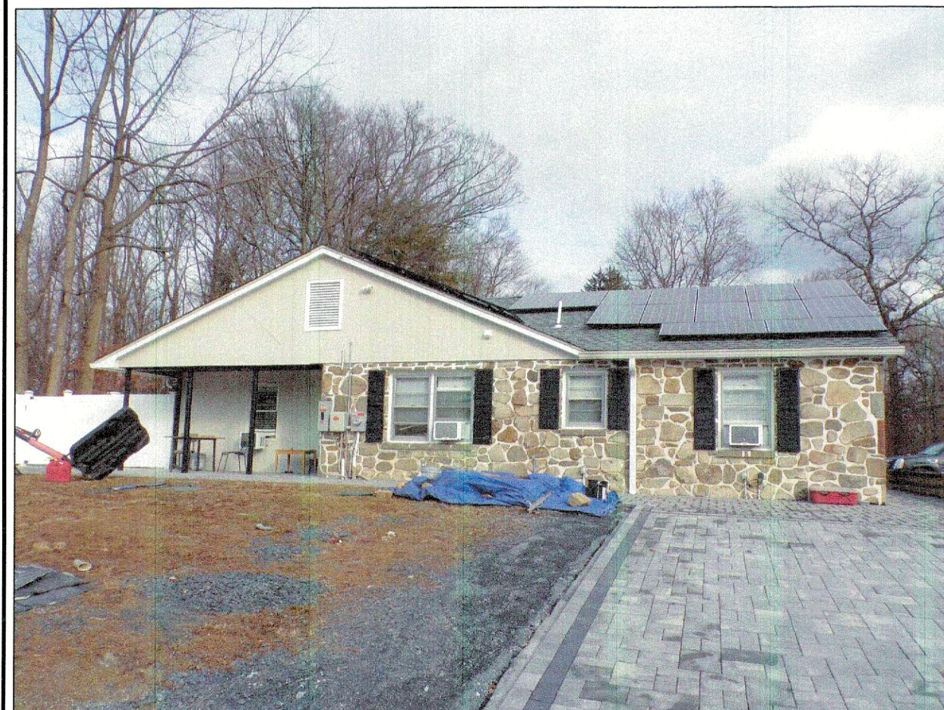
LEFT SIDE VIEW OF BUILDING