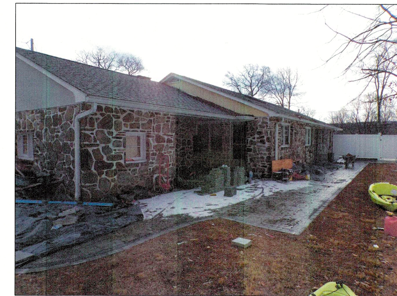
REAR VIEW OF BUILDING