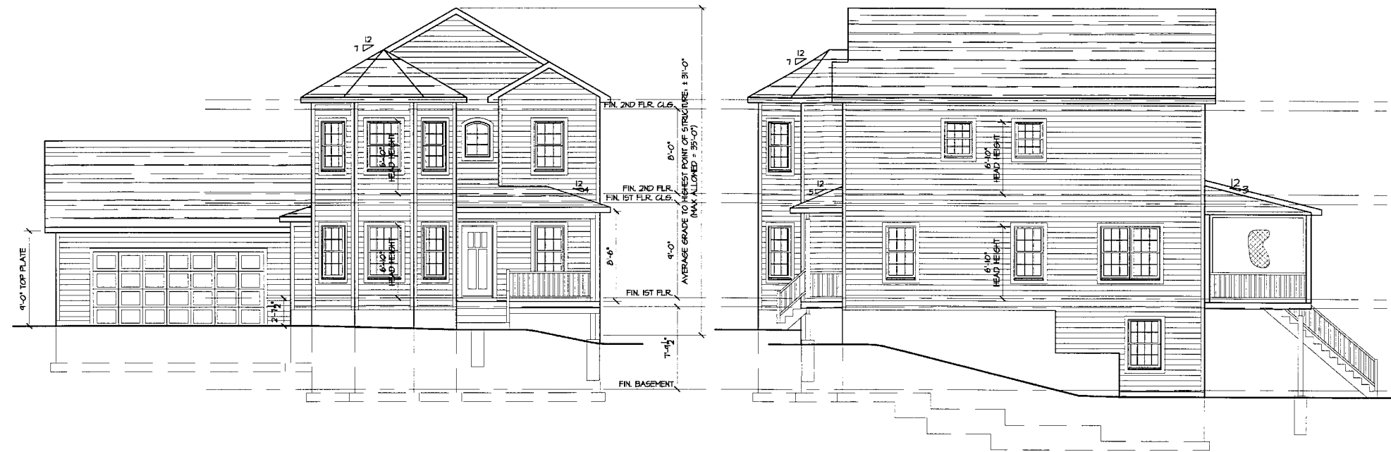
FRONT ELEVATION SCALE: 3/16" = 1'-0"